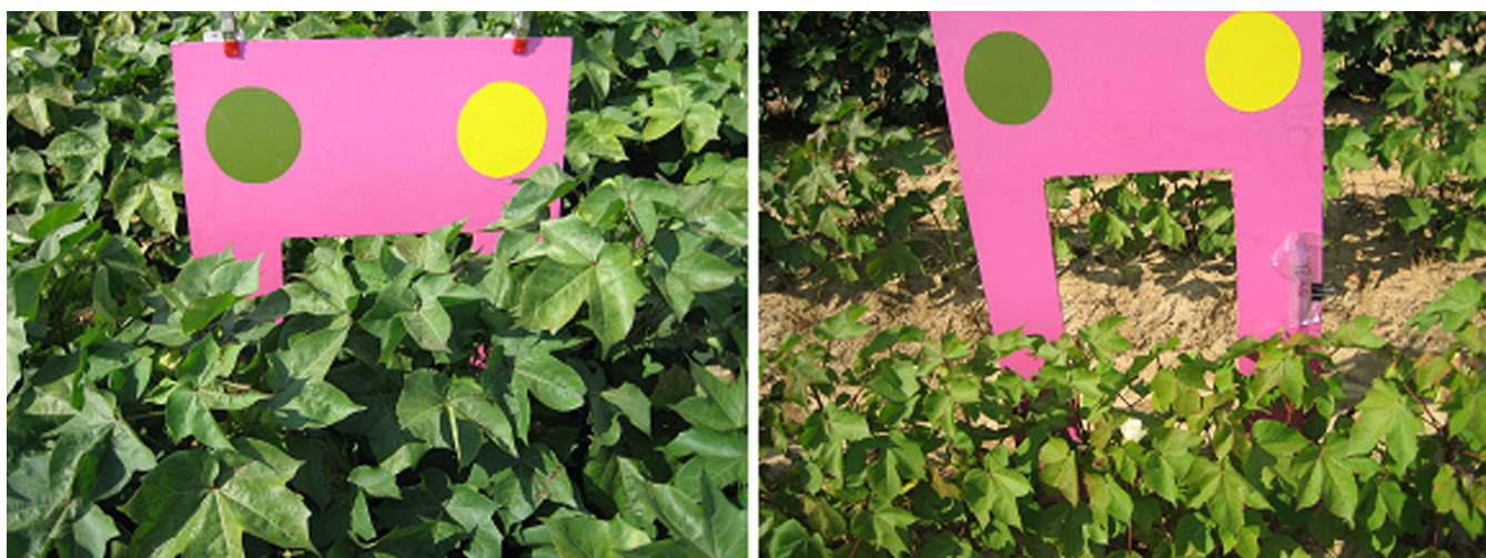
Fig. 1. Field off-nadir images of plots receiving 150 lb N/acre (LEFT) and 0 lb N/acre (RIGHT) with standardized color board in the background. Standardized color board consists of a dark green and yellow color chip on a neutral pink background to allow the normalization of each image during analysis. The high N rate treatment was taller and visibly darker green than 0 lb N/acre treatment.