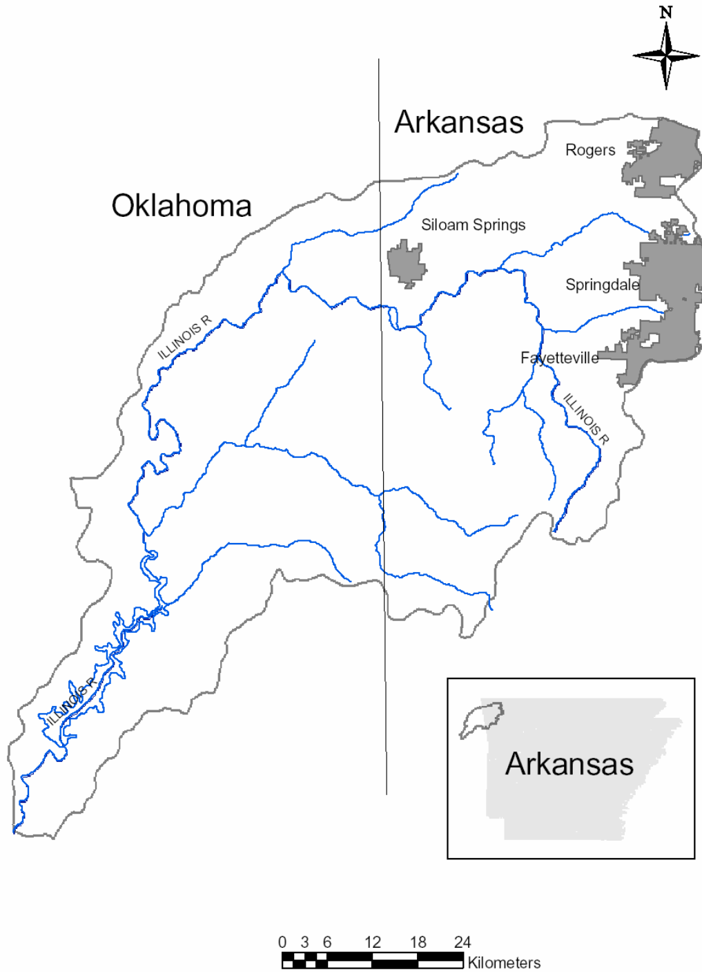
Figure 1.1. The Illinois River Basin, a trans-state watershed between Arkansas and Oklahoma with major cities and rivers. The Illinois River originates from Northwest Arkansas and flows into Northeast Oklahoma.