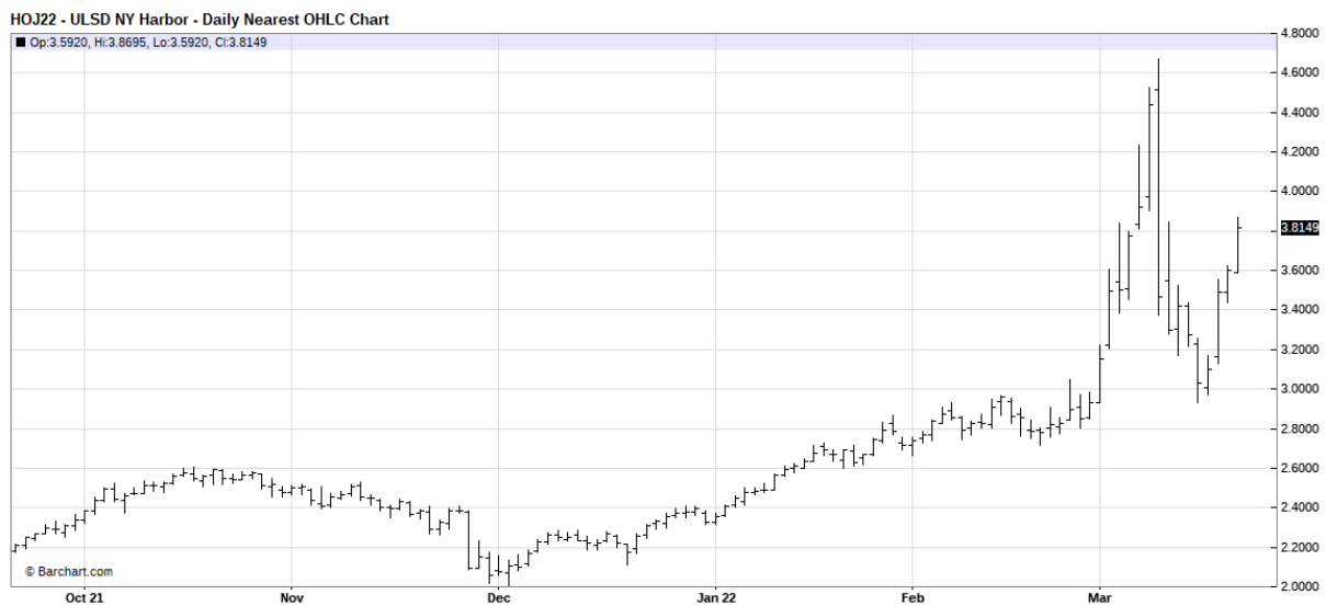
Figure 2. NYMEX Diesel, Daily Nearby Contract

Since February 24 th , oil prices have built in a meaningful geopolitical risk premium. Russia accounts for around 12% of global oil trade, making it the world's largest exporter and third-largest oil producer. Russia produced about 11% of the world's oil supply and 37% of Europe's natural gas supply last year. The combination of disruption and uncertainty continues to underpin global energy prices. Global oil markets and international gas markets had already been tightening for the past 12 to 24 months as COVID began to unwind and economies opened. West Texas Intermediate (WTI) crude oil, as well as the major fuel markets, such as diesel, have experienced added volatility in recent weeks—with WTI rising above $130 per barrel and falling below $100 per barrel at times. The chart below of New York Mercantile Exchange (NYMEX) diesel futures illustrates price trends over the past six (6) months and the recent increase in price volatility. Most notable is the steep $1.60 per gallon spike and correction in early March. Diesel futures prices currently trade near $3.80 per gallon.