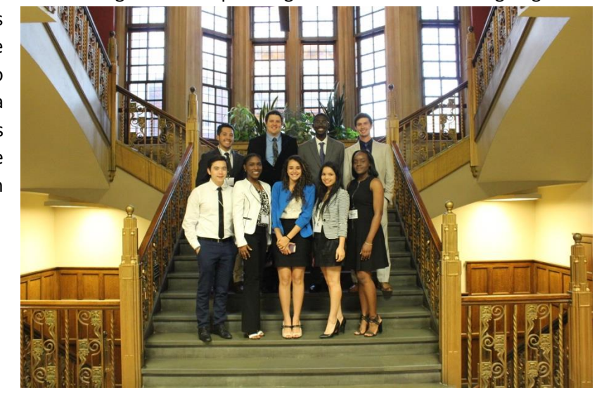
Figure 7. UA ITE Student Chapter Members Attend the Student Leadership Summit at Purdue University

Panel, professional engineers shared their experiences in the workforce and advice on steps to take when becoming a professional. Our group looks forward to participating in the event next year and perhaps even hosting one day.