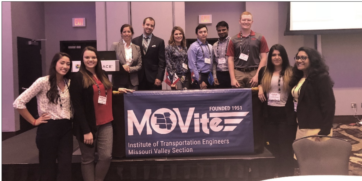
Figure 2 Group of Students that Participated in the 2018 MOVITE Fall Meeting

In addition to monthly general meetings, students also attended external events. In addition, all five of the 2018 officers attended the Southern Plains Transportation Center Transportation Leaders of the 21 st Century (TL-21) Regional Student Meeting at UT El Paso from February 8-10 th , 2018; two members of TL21/ITE attended the Midwest and Great Lakes District Student Leadership Summit at Minneapolis from August 20 th – 23 rd , 2018; eight student members, including one officers, attended to the Missouri Valley Institute of Transportation Engineers (MOVITE) Fall meeting from October 3 rd through 6 th , 2018, in Lexana, KS (Figure 2). Each of the 2018 events are summarized below.